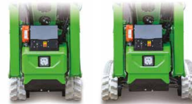
• Variable crawler gauge