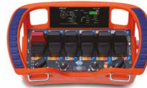
• Fully proportional wireless radio remote control